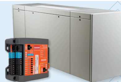
M2000 Unit Ventilator Controller