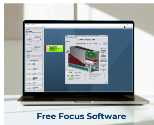
Free Focus Software